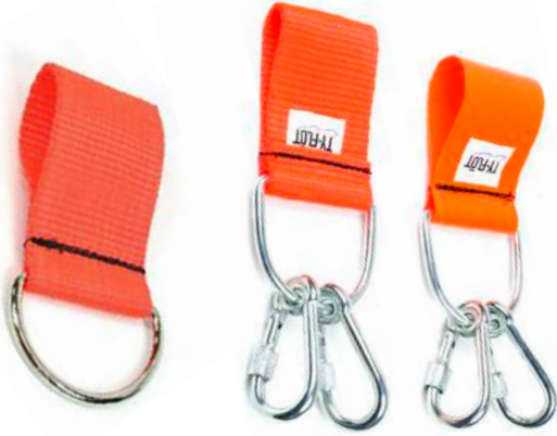
From Left to Right: BLTADDEE, BLTAD2, EZBLATD2